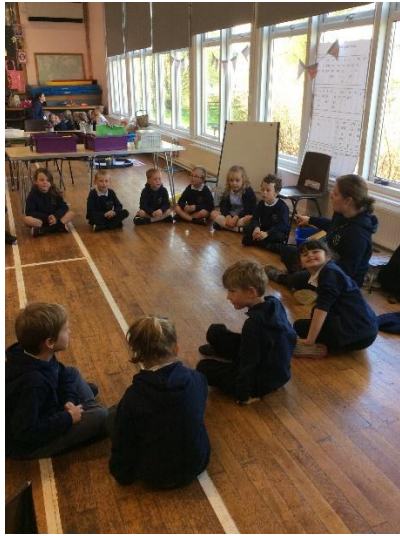
Our new learning environment.