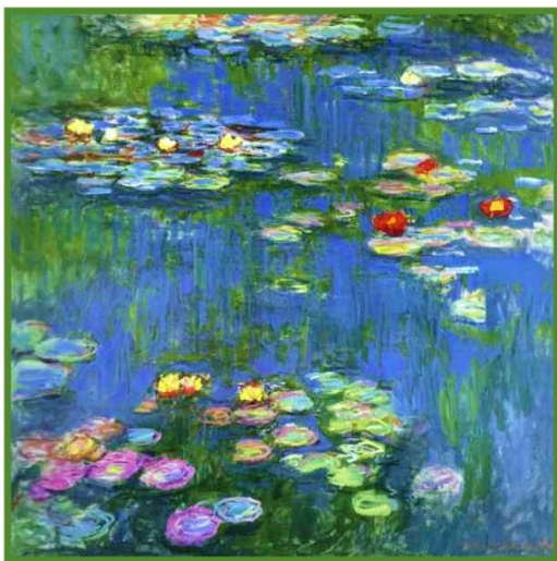
Claude Monet's Waterlilies