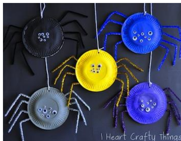
Paper plate spiders