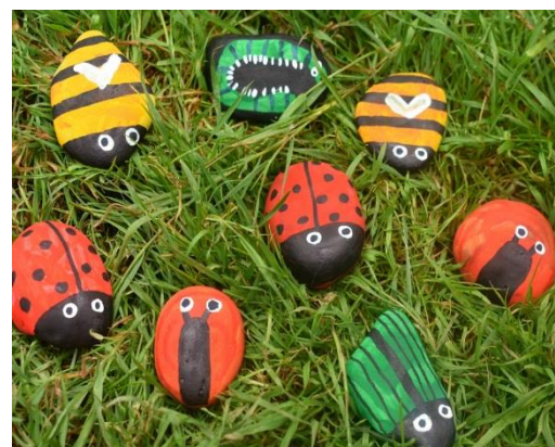
Minibeast painted rocks