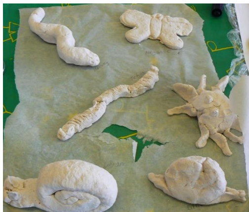
Salt dough minibeast