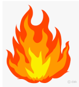
Great Fire of London.

https://www.northumberland.gov.uk/Education/Schools/School-admissions-places-appeals-1/Reception-entry-applications.aspx